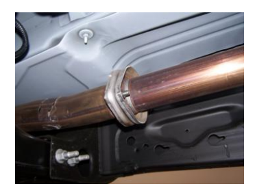
2. To remove stock exhaust, unbolt it at the flange behind the Y-pipe. Make sure to leave all rubber grommets in the factory location. You will re use stock nuts and bolts. For easier removal of exhaust, cut behind the muffler. Use WD-40 to remove hangers from grommets.

1. Disconnect the negative battery cable before removal of OEM exhaust. This will allow the computer to reset and recognize the new exhaust. Lay out the exhaust on the floor so it looks like the drawing and compare parts with manual.